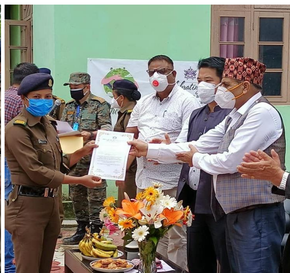
Felicitations to field staff