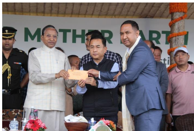
Govt SSS Makha, Gangtok District