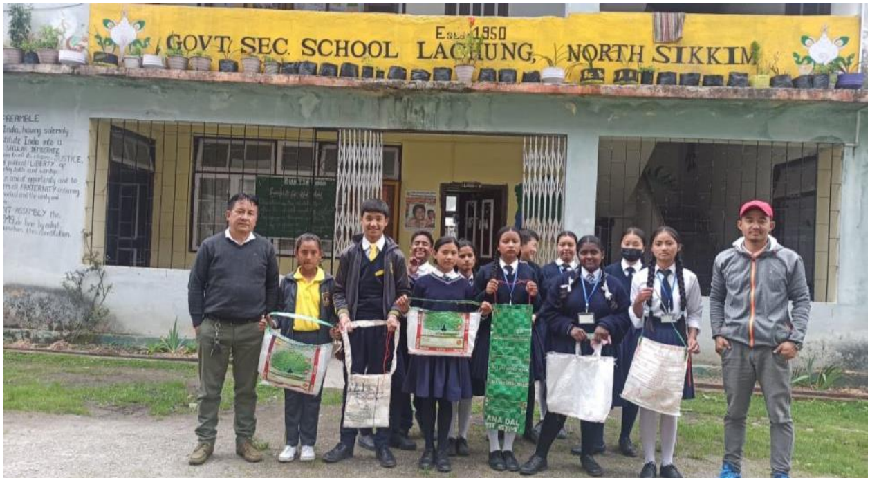
Reuse of old cloths and prepare bags