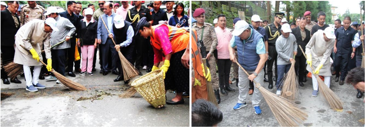
Cleanliness drive led by Hon'ble Governor, Hon'ble Chief Minister of Sikkim, Dy Speaker and Cabinet Ministers