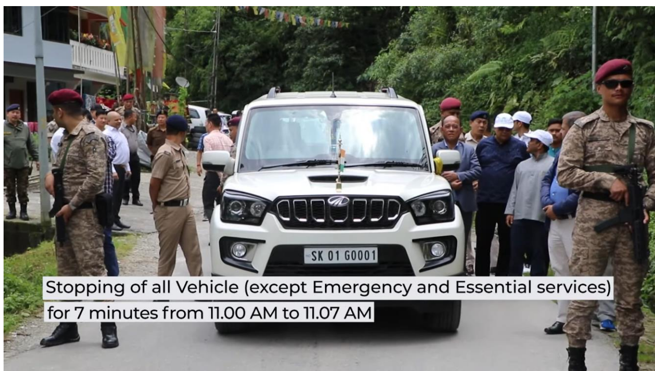
The convey and the vehicle of the HCM stopping for 7 minutes on July 7, 2022 from 11am while enroute to Golitar at Pangthang

This years' event marked the fourth successive and successful endeavor of the State Government in contributing positive climate action in combating global climate change by negating carbon emissions. Sikkim is known as a clean and green State for its natural beauty and hosts of eco-friendly policies and initiatives. Sikkim has also been tagged as a carbon negative state as per reports of Sikkim Climate Inventory and Monitoring System published by IORA Ecological Solutions Pvt Ltd., New Delhi.