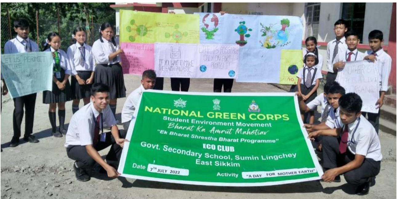
Poster and banner campaign