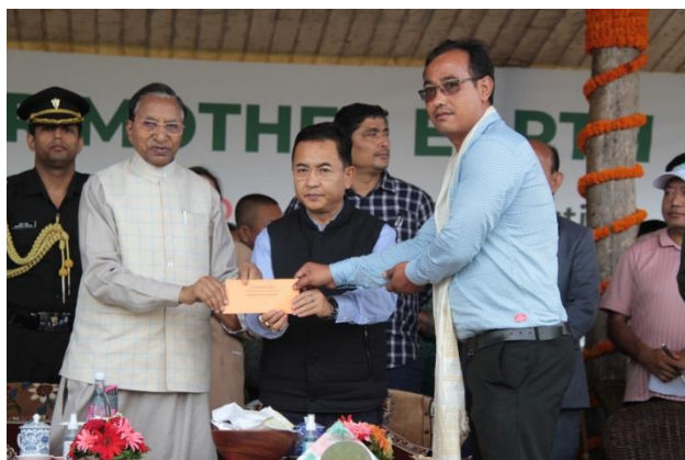
Govt SSS Chujachen, Pakyong District

Pictures below show the Head of School from participating schools receiving the grant-in-aid.