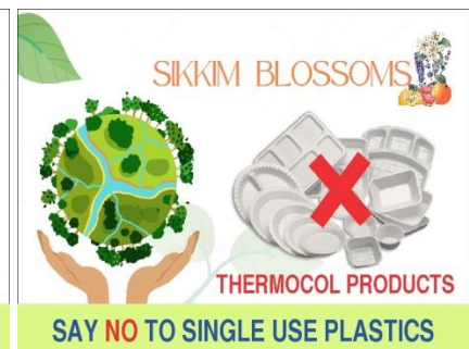
Posters on Say No to Single Use Plastics