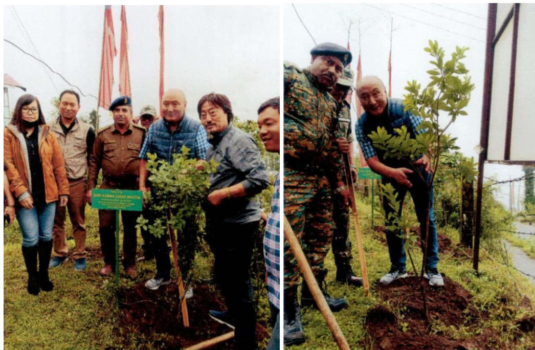
Plantation drive conducted Kabi Health & Wellness Centre