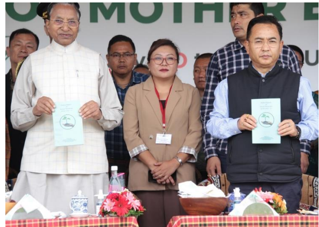
Release of Status Report on Forest Nurseries