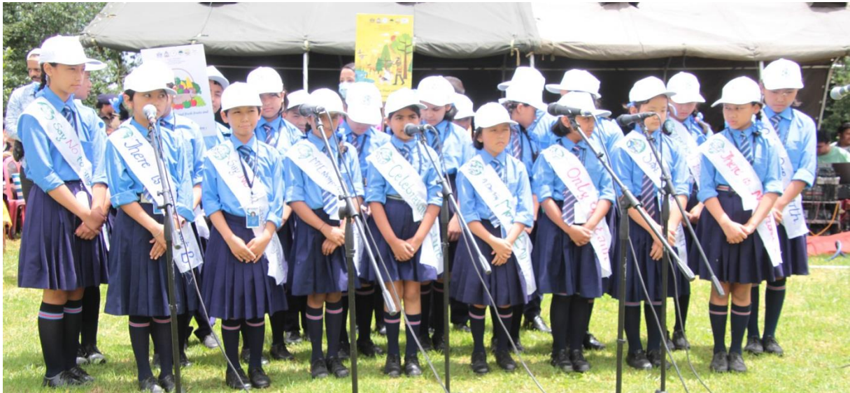
Eco-club primary students of Government Sr. Secondary School Tadong sang a beautiful Hindi song "Yeh Dharti Yeh Nadiya..." highlighting the importance of Mother Nature