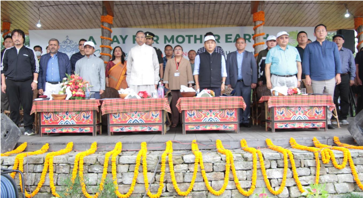
VVIPs and other dignitaries at stage rise for National Anthem