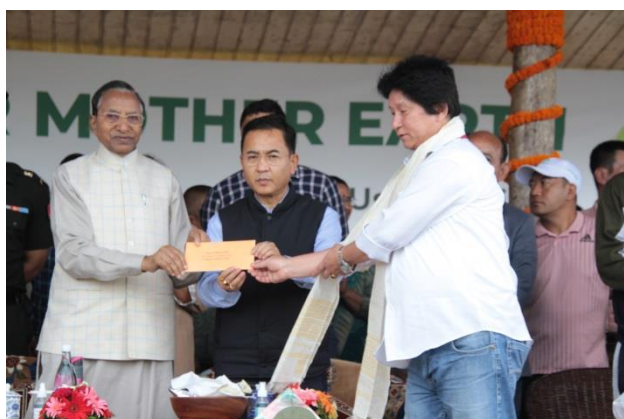
Govt SS Kamrang, Namchi District