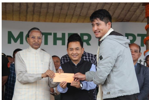
Govt SSS Phodong, Mangan District