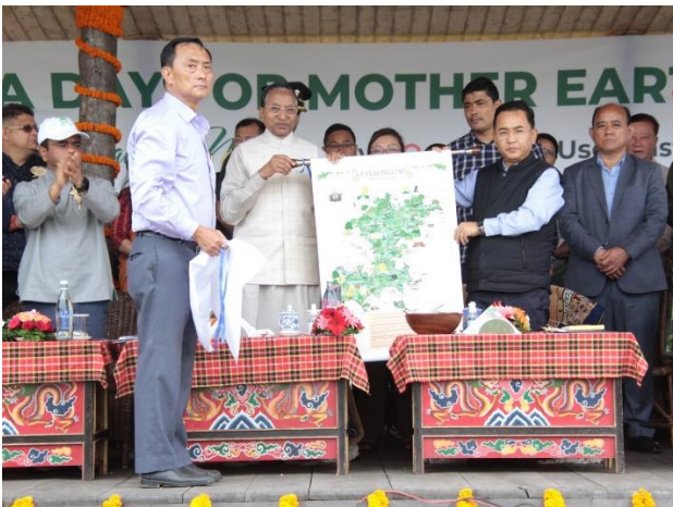
Release of Map representing natural and cultural significance of Fambonglho Wildlife Sanctuary