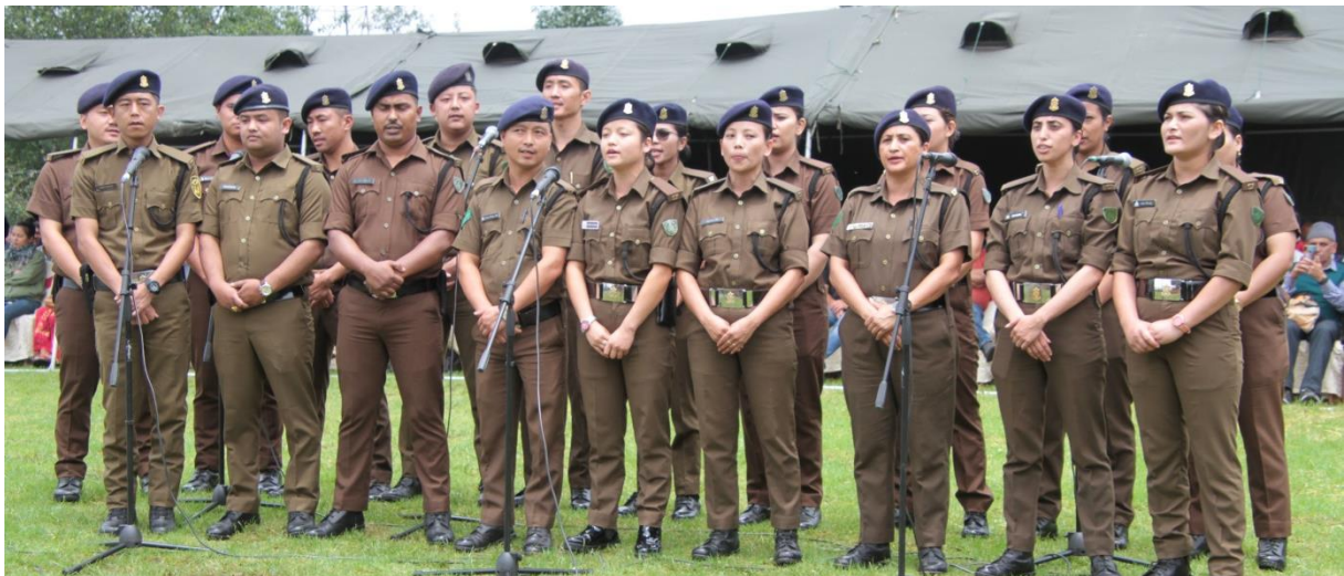
A group of 20 forest frontline staff posted across the state performed a Nepali Song "Jaha Bagcha Teesta Rangit...."