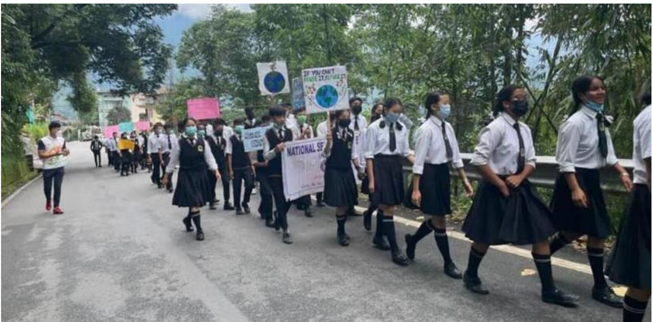
Awareness rally regarding ban on single use plastic