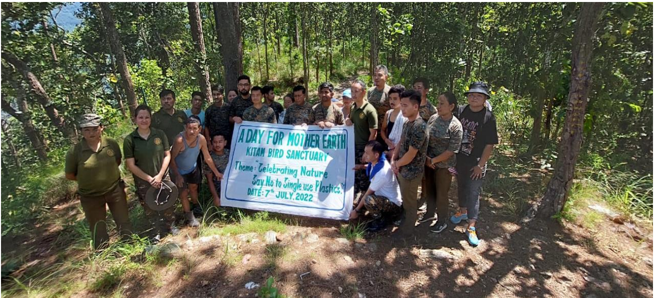
Cleanliness drive at Kitam Bird Sanctuary