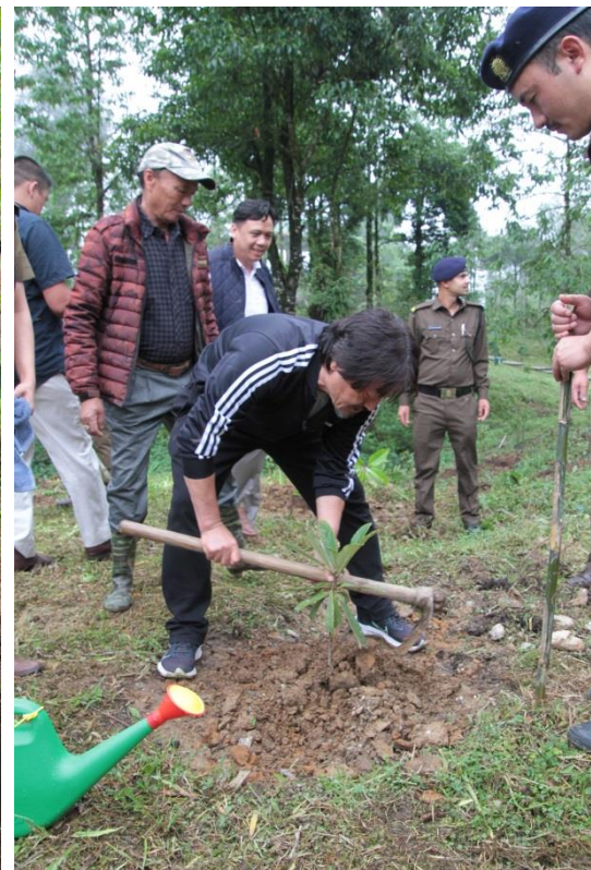
Plantation by Hon'ble Forest Minister Shri Karma Loday Bhutia