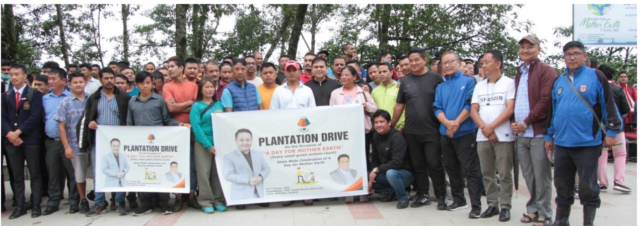
Participants at the cleanup drive