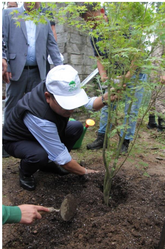
Plantation by Hon'ble Chief Minister Shri Prem Singh Tamang