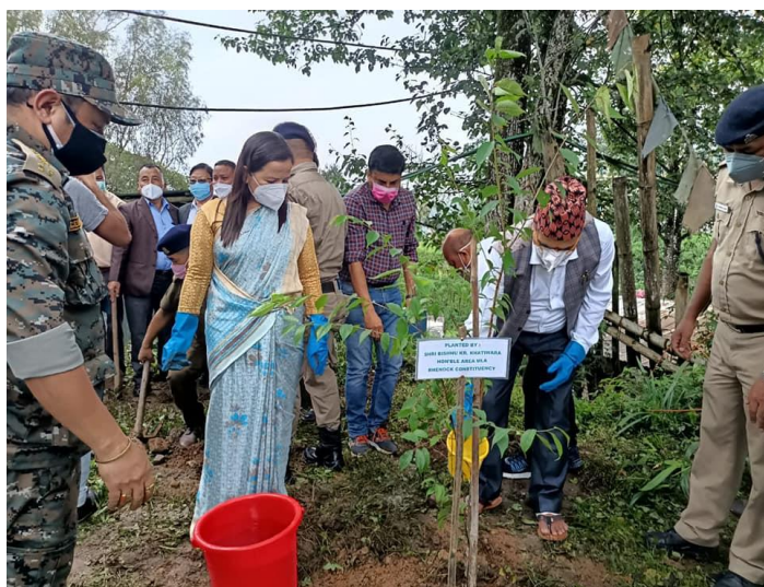
Plantation by MLA Rhenock constituency