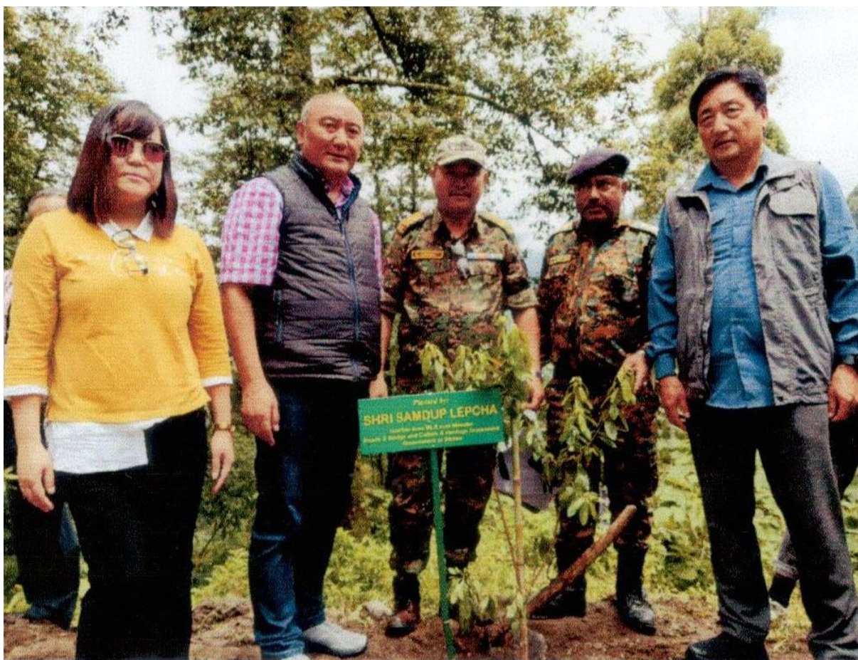
Plantation drive conducted at Gram Prasasan Kendra, Singhik