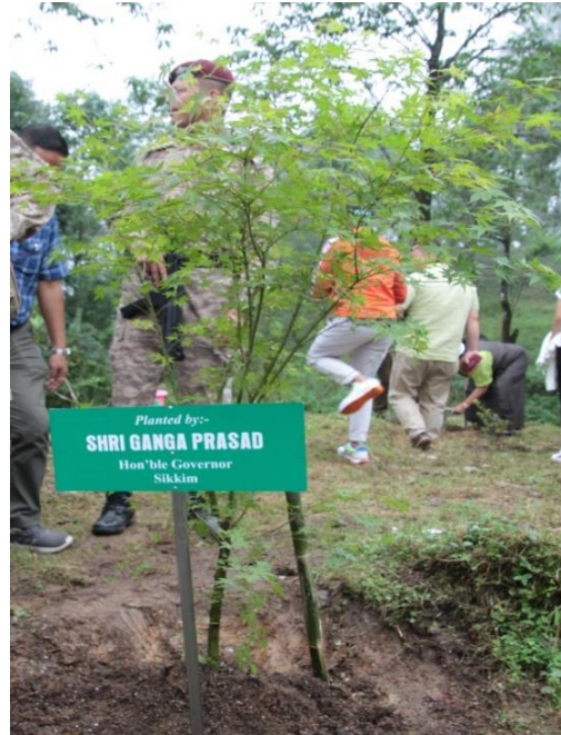
Plantation by Hon'ble Governor of Sikkim Shri Ganga Prasad