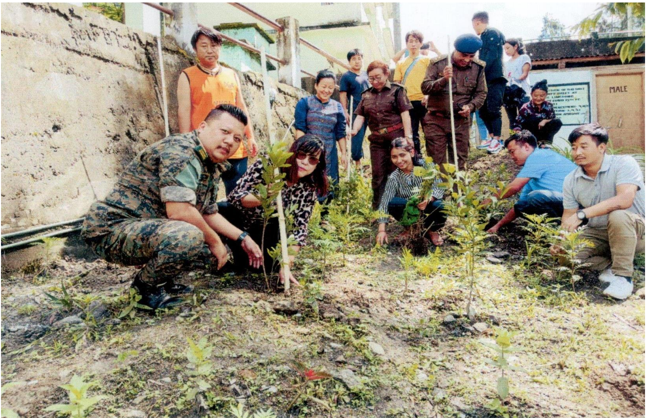
Plantation drive at Sonam Choda Lepcha Memorial Lingdong SS