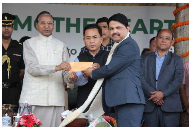
Govt SSS Soreng, Soreng District