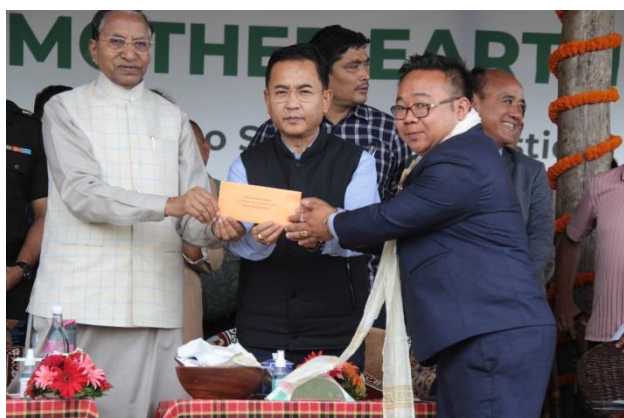
Govt SSS Kaluk, Soreng District