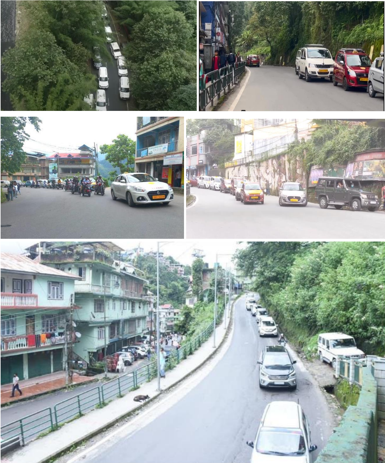
Stoppage of vehicles for 7 minutes on July 7, 2022 from 11am to 11.07am